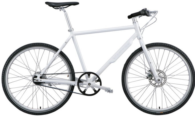
Biomega NYC bicycle

NYC will be launched the 24 th of June 2, 2014 at 16h / 4pm at Design Museum Denmark, Bredgade 68, Copenhagen and presented at the Eurobike and Interbike shows in September 2014. Learn more about Biomega at www.biomega.com